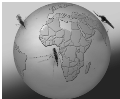
graphics: Katrin Weigmann

300 million clinical cases of malaria are reported each year, leading to 1.5 million deaths, mostly in sub-Saharan Africa. These numbers are on the increase because mosquitoes have become increasingly resistant to pesticides – the most effective weapon against malaria in the past – and because Plasmodium , the parasite responsible for the disease, is becoming more and more resistant to therapeutic drugs. An explicit goal of the genome project is to learn more about the mosquito immune system. Plasmodium can only infect humans after it has passed through the mosquito body and evaded the insect's immune responses. Anopheles ' attempts to